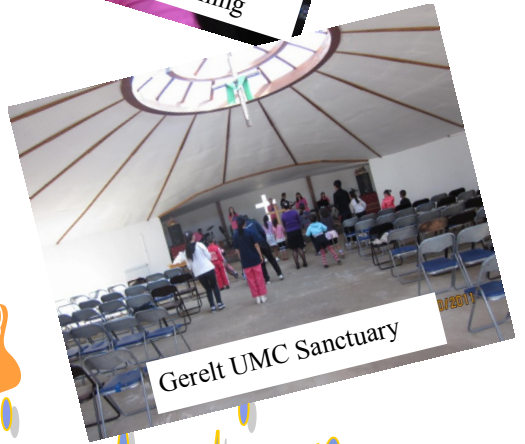
Gerelt UMC Sanctuary