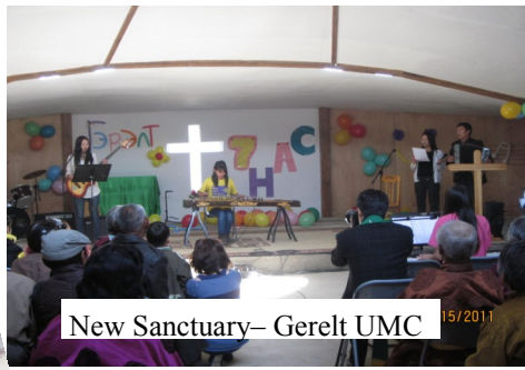
New Sanctuary- Gerelt UMC