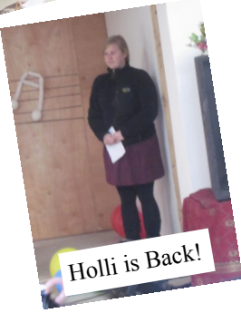
Holli is Back!