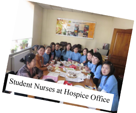
Student Nurses at Hospice Office