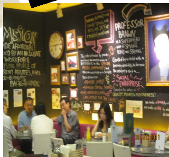
Prof. Braum Restaurant (Employs Autistic Young People) Singapore