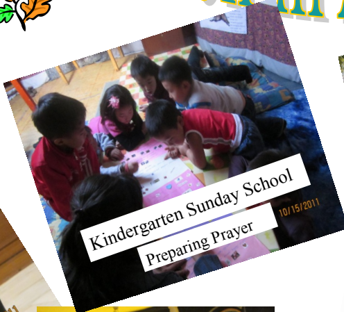
Kindergarten Sunday School Preparing Prayer