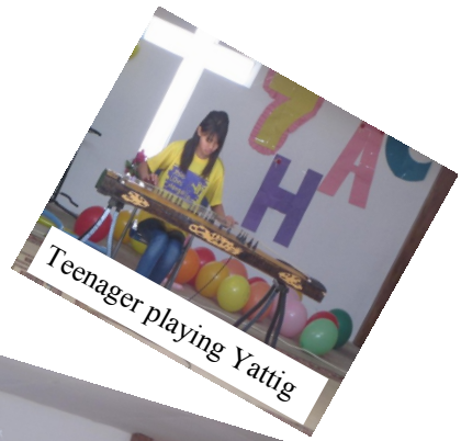
Teenager playing Yattig